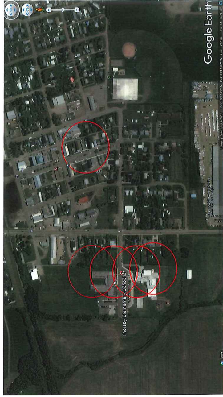
Figure 9.1(B) 1 displays the map showing area in C1 Commercial where cannabis sales may not be located